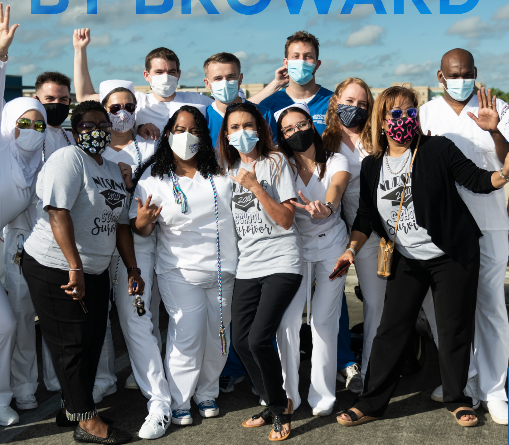
Nursing Graduation Ceremony, December 2020