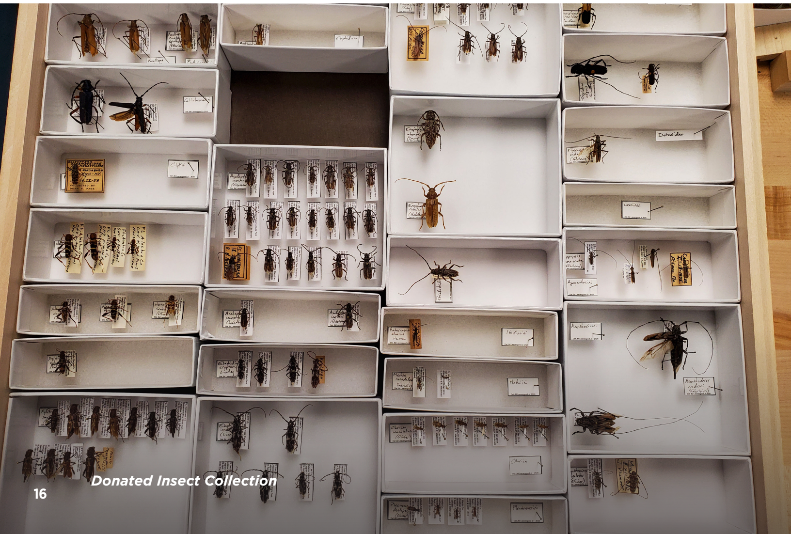
Donated Insect Collection

The study of insects serves as the basis for developments in biological and chemical pest control, food and fiber production and storage, pharmaceutical epidemiology, biological diversity, and a variety of other fields of science. This insect collection inspires students through hands-on experience in entomology.