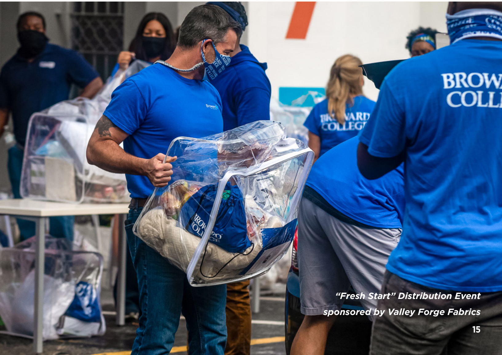
“Fresh Start” Distribution Event sponsored by Valley Forge Fabrics

130+ Students enrolled in Rapid Credentials programs who live in Broward UP communities received a free laptop thanks to a donation by Florida Power & Light of 400 laptops